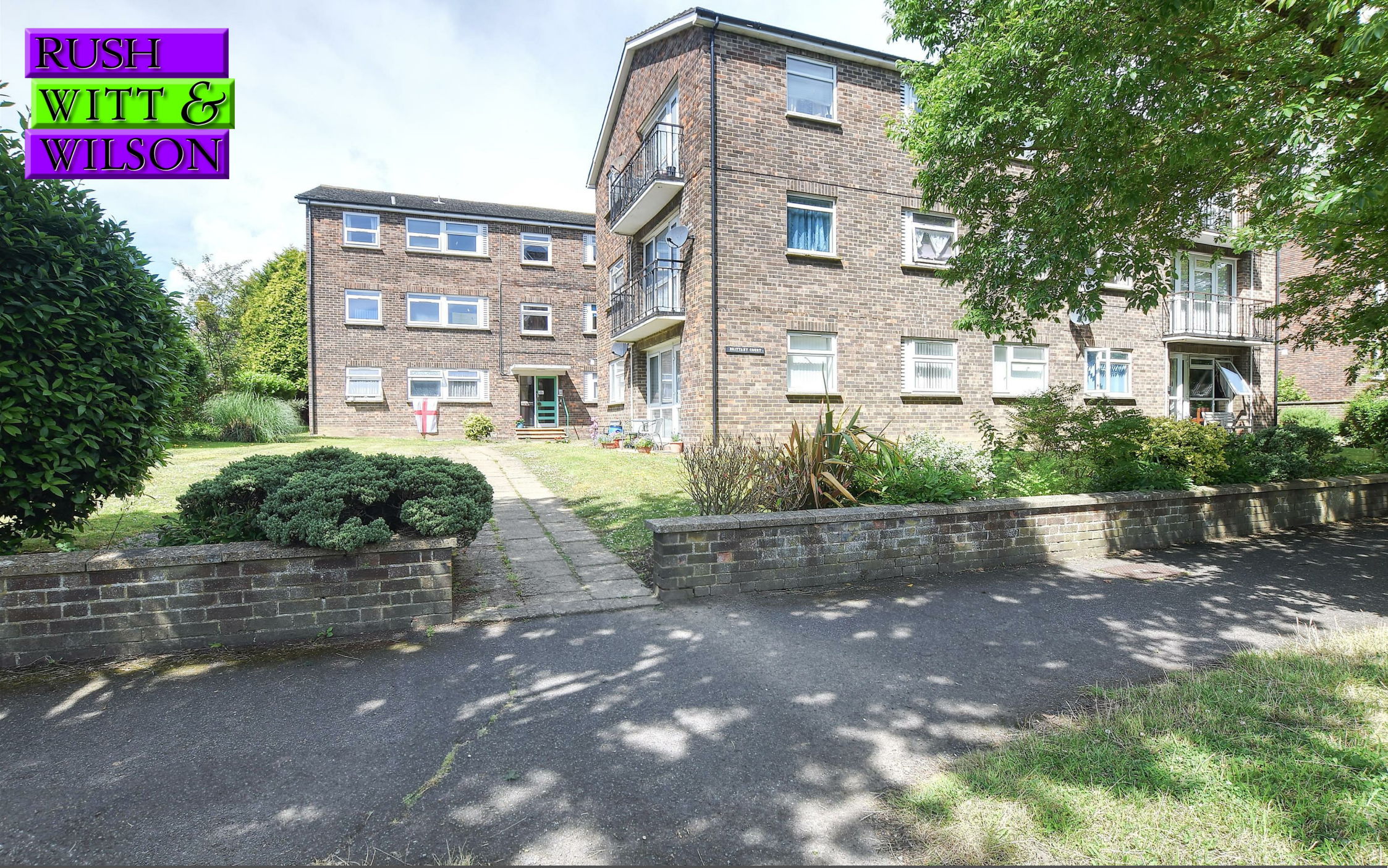
Brittany Court Sutherland Avenue, Bexhill-On-Sea, East Sussex TN39 3QS £149,000